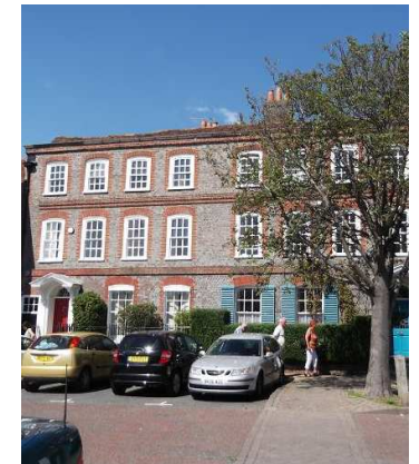
Wentworth & Havelock