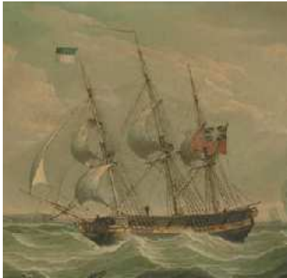
An Armed Sloop