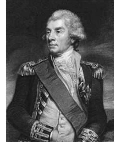
Admiral Lord Keith