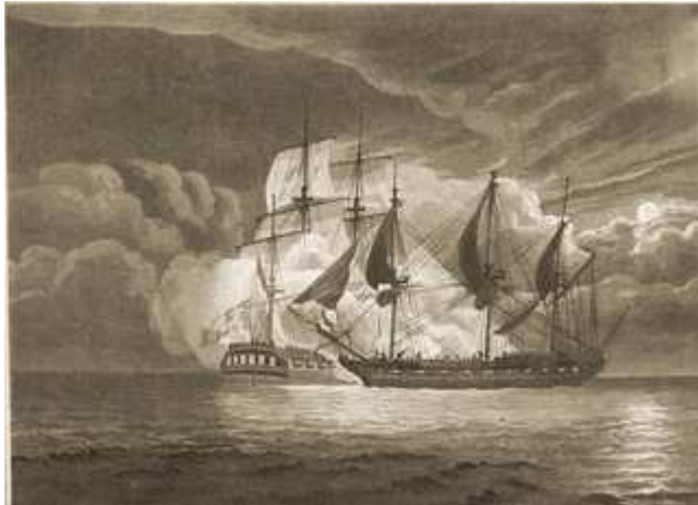
The taking of Concorde

On 15th February 1783, Magnificent sighted the 36-gun French frigate Concorde , which ship opened fire with her stern chasers. Magnificent overhauled the French ship and after fifteen minutes forced her to strike her colours. Soon after her surrender, the Concorde's main topsail caught fire, forcing the crew to cut away the mainmast to extinguish it. Two other British ships joined Magnificent towed Concorde to St. John's, Antigua.