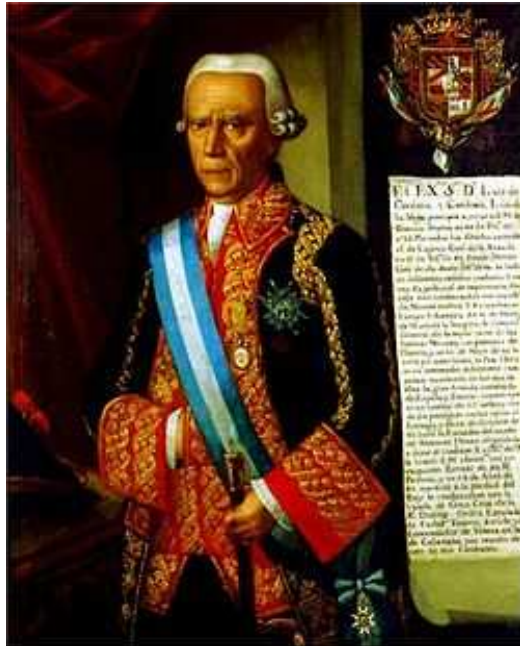
Luis de Córdova y Córdova