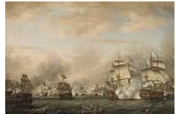
The Battle of the Saintes

Robert's ship was then dispatched under the flag of Sir Samuel Hood to search for other French ships and, on the 19th April 1781, engaged them at the Battle of the Mona Passage during which she captured the 32-gun frigate Aimable .