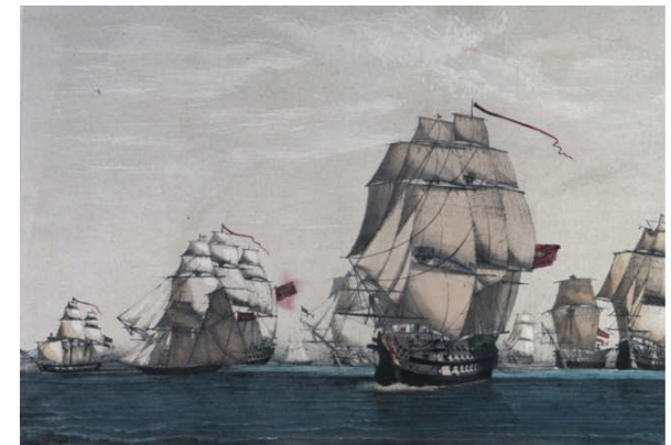
Spanish fleet under Luis de Córdova y Córdova

On the 12th May 1781, Thetis struck a rock off Saint Lucia and was wrecked.