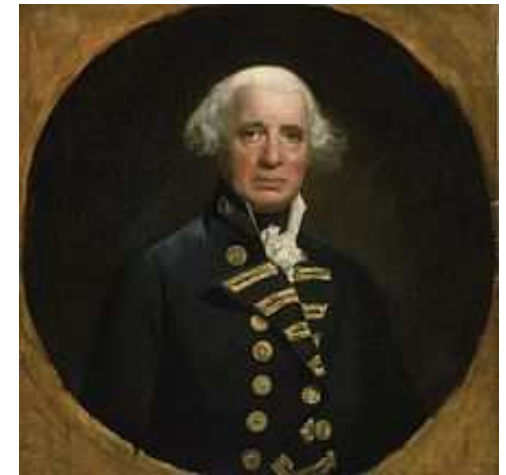
Admiral Lord Howe