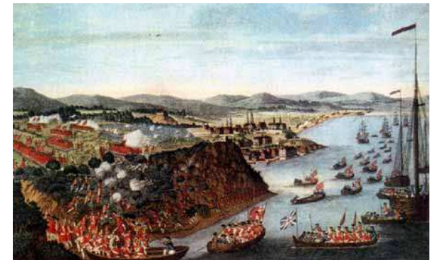
The Relief of Quebec