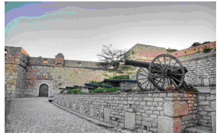
Tunis – old fortifications