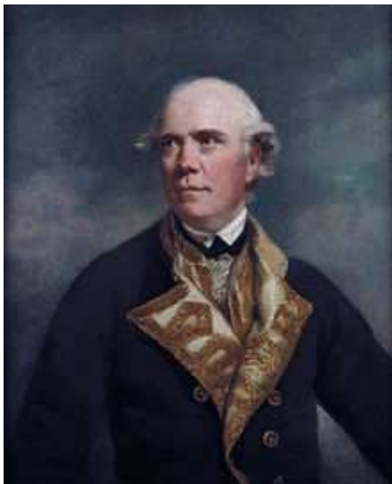
Admiral Samuel Barrington

On 15th February 1783, Magnificent sighted the 36-gun French frigate Concorde , which ship opened fire with her stern chasers. Magnificent overhauled the French ship and after fifteen minutes forced her to strike her colours. Soon after her surrender, the Concorde's main topsail caught fire, forcing the crew to cut away the mainmast to extinguish it. Two other British ships joined Magnificent towed Concorde to St. John's, Antigua.