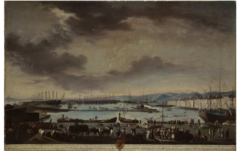
Toulon in 1793